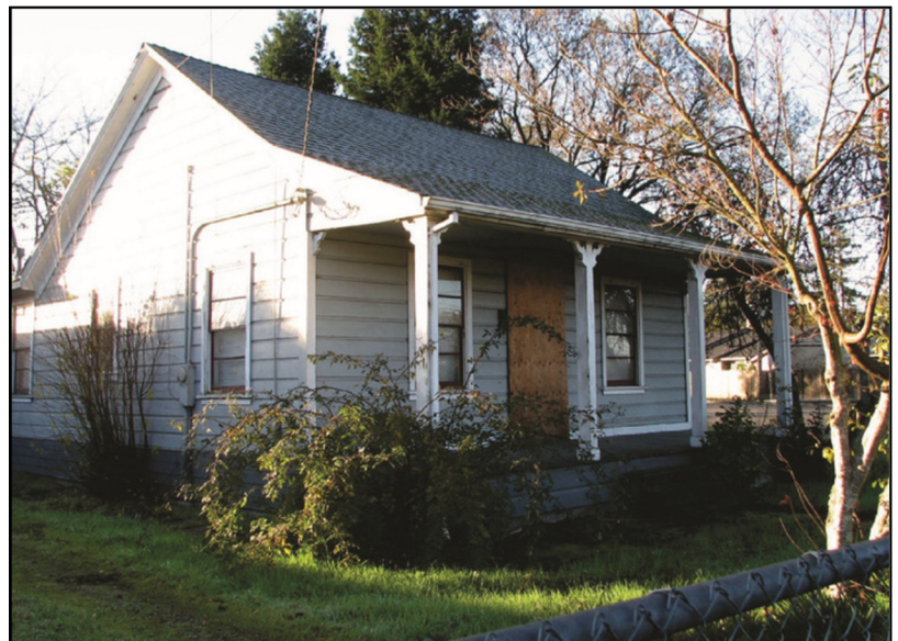
330 Hewett Street, Santa Rosa

Background: The 330 Hewett Street Property was acquired by Sonoma Water in 2001 as part of a settlement with the previous property owner. The previous owner was in the process of subdividing the property when the discovery of elevated concentrations of lead in the soil that was attributed to fill material that was placed on the property during construction of the Santa Rosa Creek channel halted the previous owner's development of the property. As a condition of the negotiated settlement with the previous owner, Sonoma Water purchased the property. Sonoma Water contracted with an outside consultant to determine the extent and location of the contamination in the soil at the property. Based on the consultant's study, Sonoma Water prepared a lot line adjustment, which was approved by the City of Santa Rosa, placing the small contaminated area within Sonoma Water's adjoining Santa Rosa Creek property. As the remaining 330 Hewett Street property no longer contains identified soil contamination and as the property is not needed for Sonoma Water use or purpose, the property has been offered for sale.